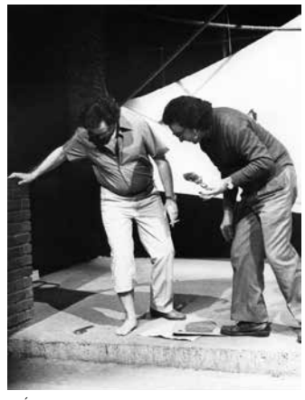
L'Éboulement, 1982. Paris. 2019.