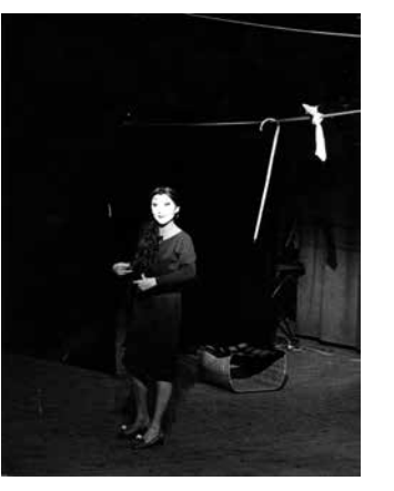
Semimaru, 1966. © Bosch, 2019.

L'Éboulement, by the poet and art critic Jacques Dupin, was presented in a kind of warehouse as part of the theatre cycle Les Intérieurs. Théâtres d'appartement. Tàpies used white sheets, rope and some coloured marks, such as the red footprints of a foot, numbers and the names of the characters in the play written on the wall.